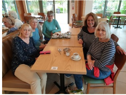
Cream Tea at Hyde Hall