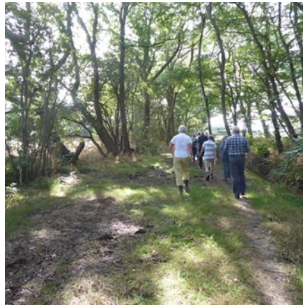
Septembers Bicknacre Walk