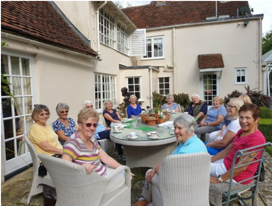
Gardening Group at their September Meeting