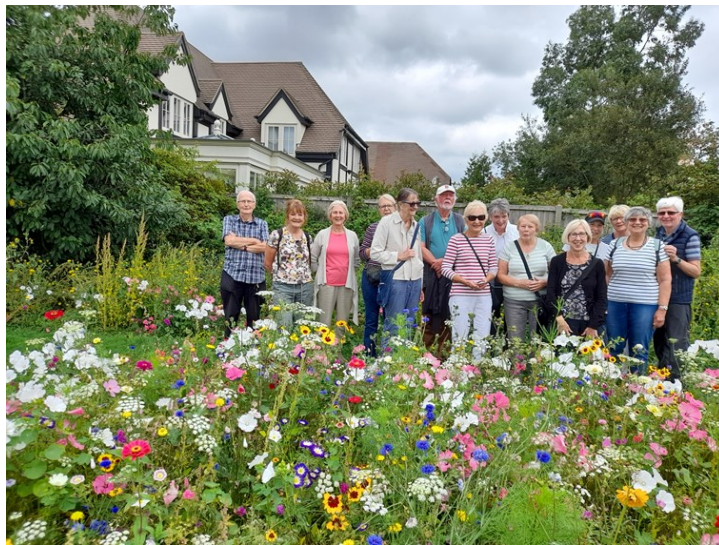
Strollers Photo Call