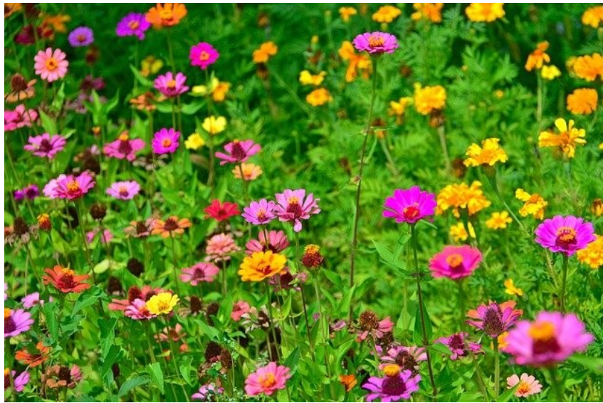
Colourful Summer Flowers