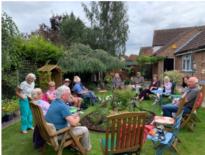
Wine Appreciation 3 - August Meeting